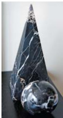
On the desk in the designer's brightly lit home study is a pyramid and ball made of Nero Marquina marble.