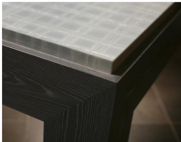
The Lola Cocktail Table , poured resin top, gray veneer base. $5,200. "This can be ordered in a variety of colors and patterns. It's durable, yet it has a sense of translucency and depth to it."