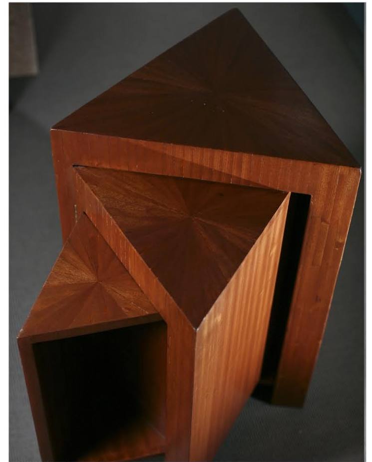
The Surprise Table , mahogany. $3,500. "There are three nesting tables that fold into each other. When it's closed, you expect it to be a solid triangle. Then it unfolds, like origami sculpture."