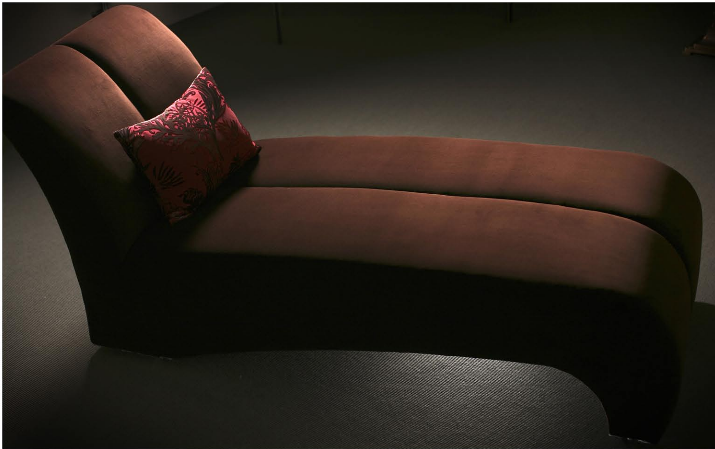
The Vimla Chaise , cotton velvet. $3,525. "This is a recamier, a fainting couch. This is our 21st century version. I like it because it's sleek. It's sculptural. It's a great place to put your feet up and read a book. There's a sense of style to it. A lot of chaises are so small. This is about 4 inches longer than the typical chaise. It's 6 feet long."